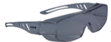
1680502 • Smoke Lens