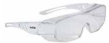
1680501 • Clear Lens