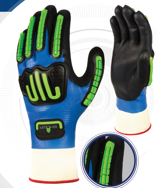
Flexible and Durable TPR Shields