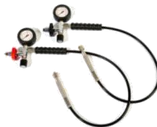
Filling hose PN200 (black) and PN300 (red)