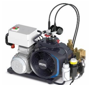
JUNIOR II-E with automatic condensate drain system

The automatic condensate drain removes water from the intermediate separator and the final separator automatically during both operation (every 15 minutes) and shutdown. In addition, the compressor is switched off automatically when the final pressure is reached.