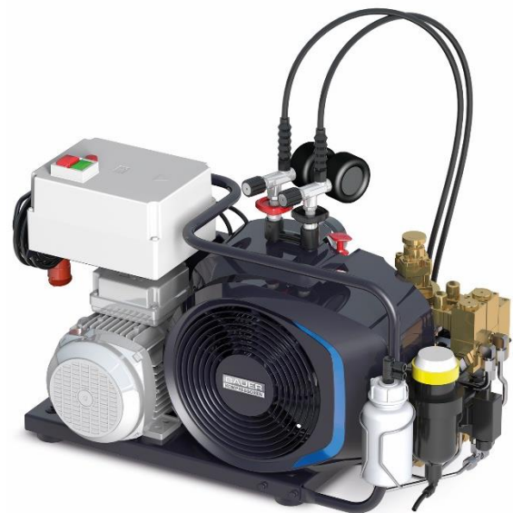
JUNIOR II-E (including accessories)