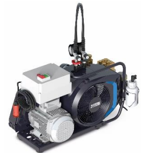
JUNIOR II-E with automatic condensate drain system and control box