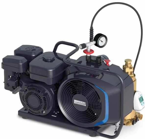
JUNIOR II-B (including accessories)