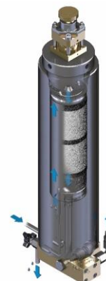
Purification System P21/350