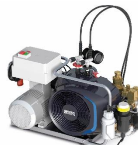
Automatic condensate drain system and control box

The automatic condensate drain removes water from the intermediate separator and the final separator automatically during both operation (every 15 minutes) and shutdown. In addition, the compressor is switched off automatically when the final pressure is reached.