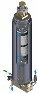
Purification System P21/350