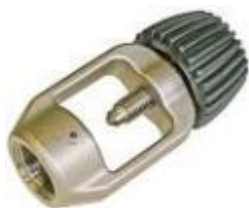
International filling connector

High-quality high-pressure filling hoses made from food-safe and long-life hose material make for flexible and safe handling. Swivel hose connections enable the filling valve to be connected to the breathing air cylinder quickly, easily and safely.