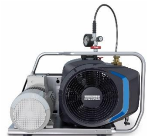
Stainless steel frame

Primary and supporting frame are in stainless steel for better corrosion resistance.