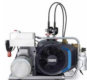
Automatic condensate drain system

The automatic condensate drain removes water from the intermediate separator and the final separator automatically during both operation (every 15 minutes) and shutdown. In addition, the compressor is switched off automatically when the final pressure is reached.